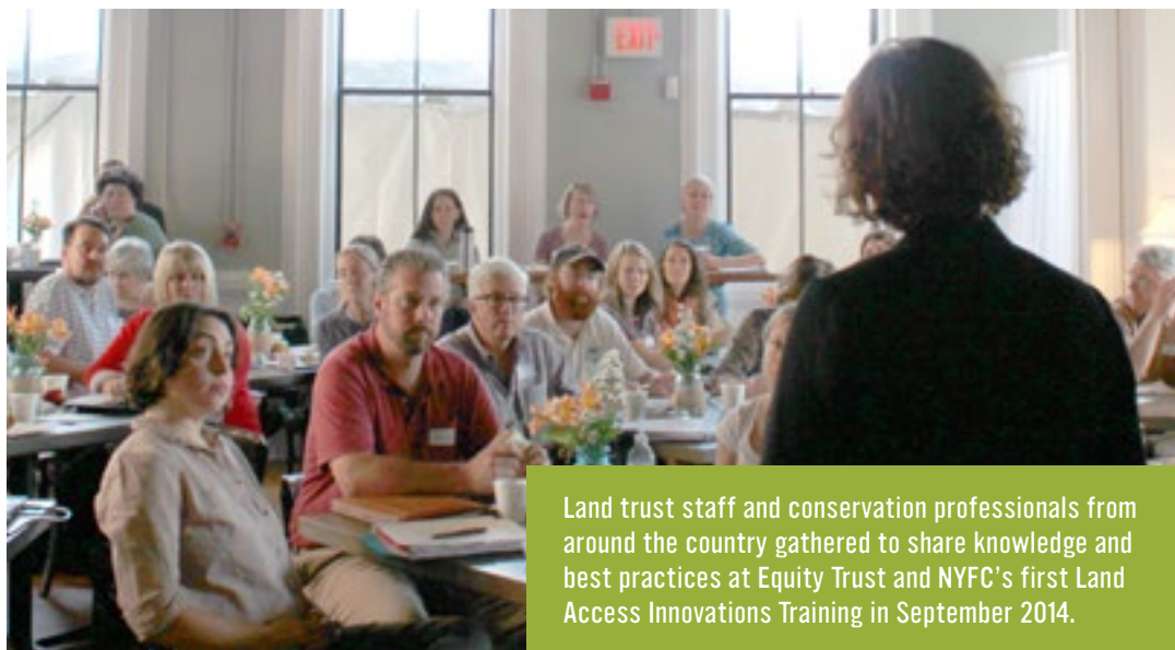
Land trust staff and conservation professionals from around the country gathered to share knowledge and best practices at Equity Trust and NYFC's first Land Access Innovations Training in September 2014.